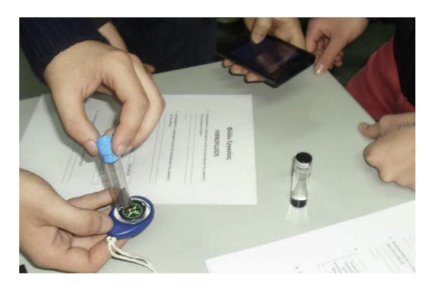
Fig. 2. MBA in science lab.

After the three week period, students were asked to fill-out a questionnaire with their perceptions about their experiences using mobile devices for their assessments and their level of acceptance of mobile-based assessment.