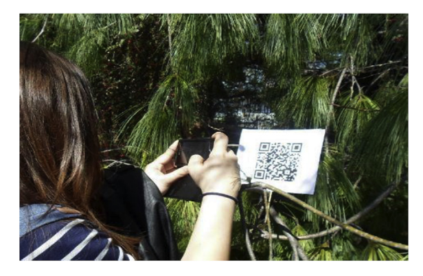
Fig. 3. MBA in a field trip.